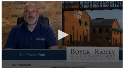
It's Time to Have "The Estate Plan" Talk Transcript

IT'S TIME TO HAVE "THE ESTATE PLAN" TALK